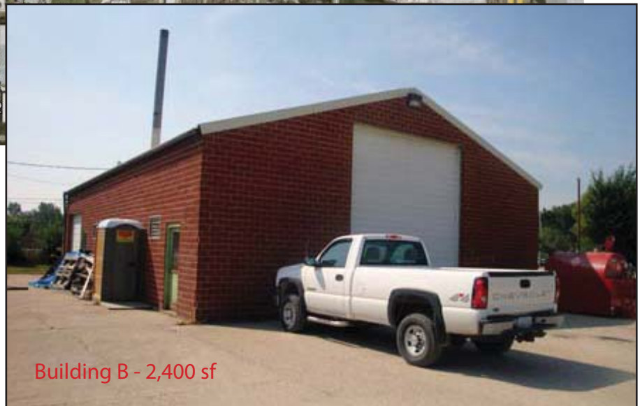
Building B - 2,400 sf

© 2010 CB Richard Ellis, Inc. The information above has been obtained from sources believed reliable. While we do not doubt its accuracy, we have not verified it and make no guarantee, warranty or representation about it. It is your responsibility to independently confirm its accuracy and completeness. The value of this transaction to you depends on tax and other factors which should be evaluated by your tax, financial and legal advisors. You and your advisors should conduct a careful, independent investigation of the property to determine to your satisfaction the suitability of the property for your needs.