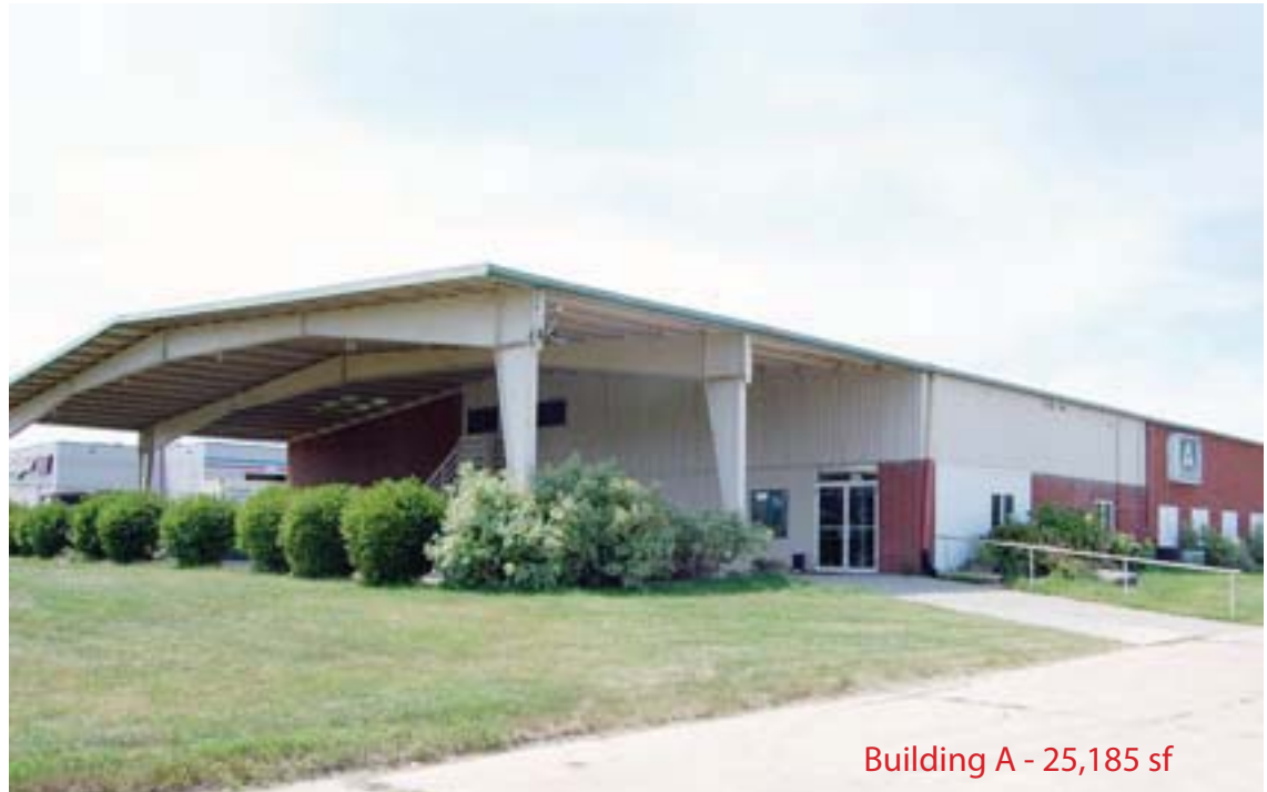
Building A - 25,185 sf

27,585 sf industrial building on 4.7 acres with outside storage. Just south of I-80/I-35. Warehouse and office showroom.